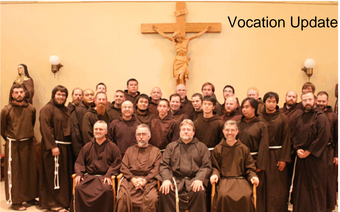
All 26 novices with their four directors. Too many names to list!!!!