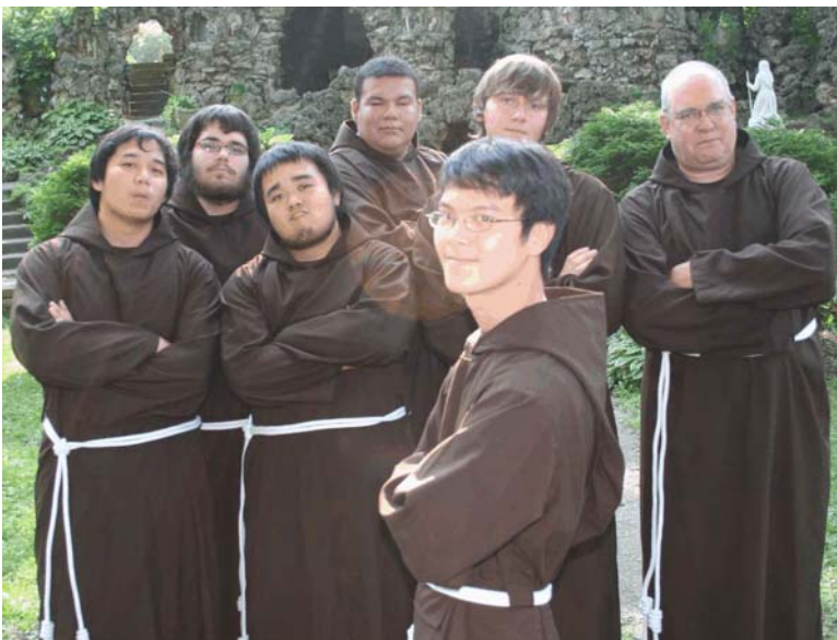
The new novices obliged when the photographer asked for a little attitude.

PLEASE PRAY FOR our new postulants who begin their postulancy on August 19 th in Chicago: