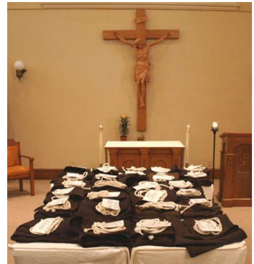
All 26 habits, waiting for new novices

Professed Capuchins from the crowd helped the new novices to put on their habits.