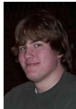
Kyle Birkenmeier could not attend but is applying to Postulancy.