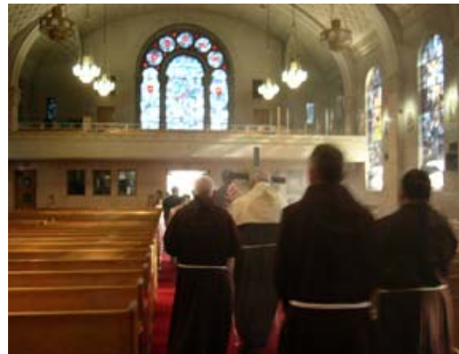
The procession began in the parish each night.