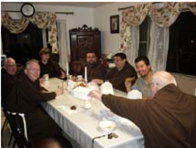
Pan dulce for a post prayer gathering.